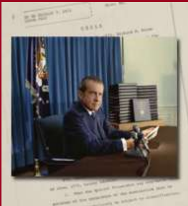
Releasing the transcripts of the White House Tapes (Richard Nixon Library, Yorba Linda, CA).

The National Archives and Records Administration has publicly released the June 23 - 24, 1975 transcripts of President Richard Nixon's Watergate grand jury testimony. It is the first time that the public has had access to the transcripts.