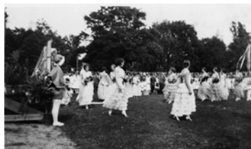
May Day 1929