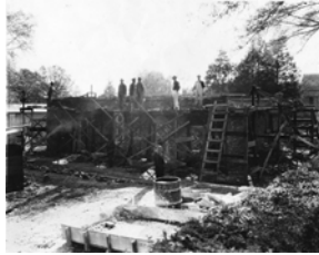
Little Chapel Reconstruction 1936