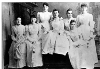
Class of 1891

On April 20 and 21 the Archives will have an exhibit of Winthrop memorabilia in the recently renovated Little Chapel for Alumni Weekend. We will be exhibiting uniforms from the 1890s, 1920s, 30s, 40s, and 50s; photographs from the early history of Winthrop, D.B. Johnson's pince-nez, early Winthrop documents, memorabilia of all kinds and much more. The exhibit will be open on Friday, April 20 from 1:00 to 5:00 pm and on Saturday, April 21 from 9:00 am to 1:00 pm. The Archives staff will be on hand to answer any questions you may have. Please come by to see the display and the Little Chapel.