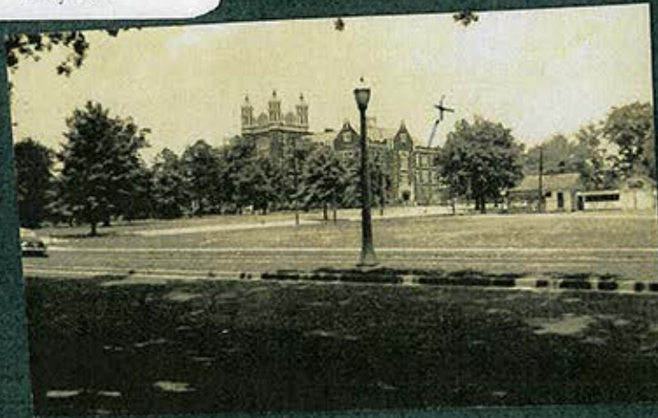
Winthrop Training School Spring 1941