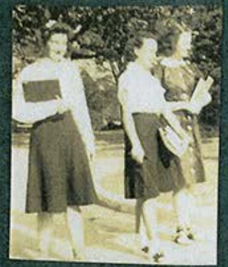
Winthrop College Uniforms 1939