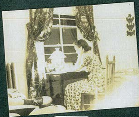
Studying in 1939