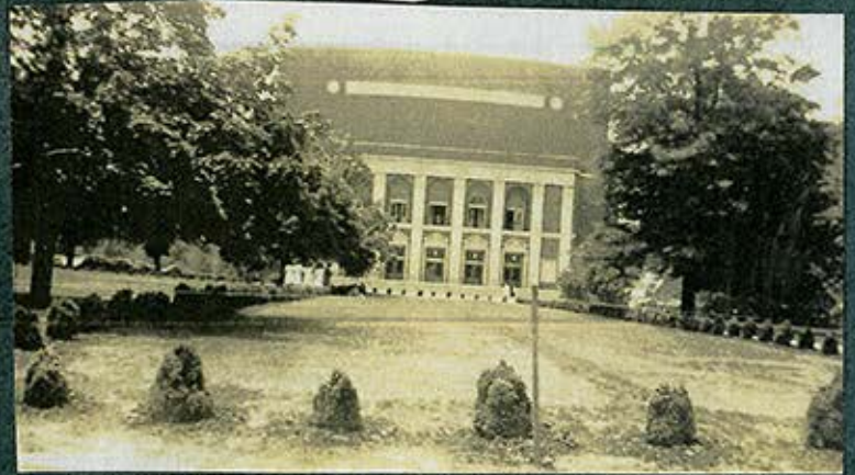
New Auditorium (Byrne's) June 1941