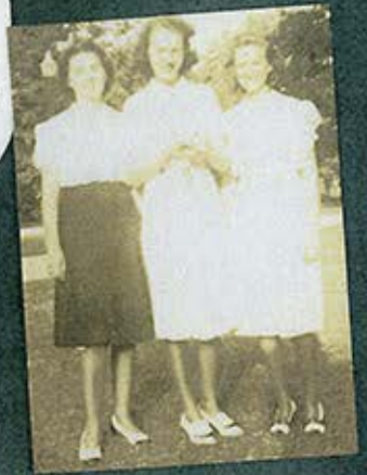
Going to practice teach at Winthrop Training School