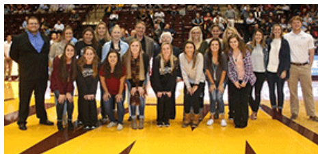
Many of the student-athletes who achieved a 4.0 GPA during the 2015-16 year are pictured.

ROCK HILL, SOUTH CAROLINA — Winthrop Athletics recently recognized 165 student-athletes for achieving Big South Conference Presidential Honor Roll status with at least a 3.0 grade point average for the 2015-16 academic year.