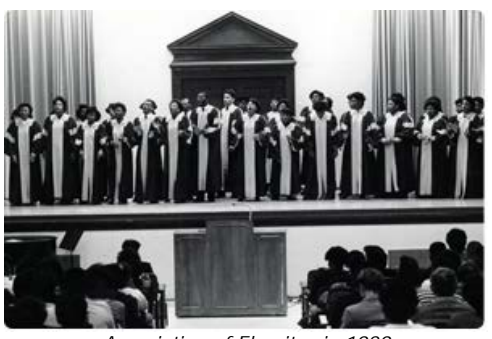
Association of Ebonites in 1989