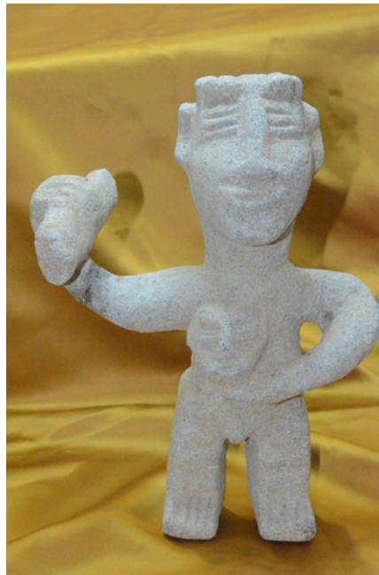
Artifacts from the Salazar collection