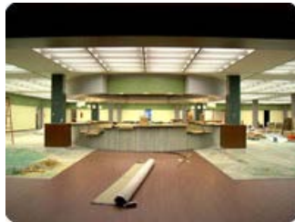
A shot of Dacus circa July 2012

ROCK HILL, S.C. — The Ida Jane Dacus Library's Renovation Celebration will be one for the books on Sept. 4 with food, music, contests and fun.