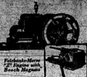
Falkenstein-Merz 27 Engine with Bosch Magneto

Chicago.—The doom of Chicago's night life was forecast today when Charles A. Clyne, district attorney, notified every well known cabaret in the city to not only cease selling liquor, but to prohibit guests bringing their own. Mr. Clyne threatened to close every place where guests were allowed to use hip-pocket flasks and to arrest the proprietors and waiters for violation of the Volstead act.