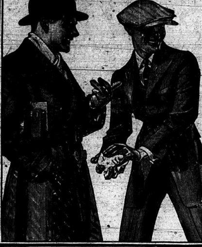
Copyright 1926 The Home of Kuppenheimer