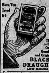
Have You Tried It? This is the Only Original BLACK-DRAGHT Liver Medicine.

W K I N G S H E L V E A B R I F F P A R I E R I N T E R M O D E R N B O O K S C H E F F E R I N G L A S T Y E A R S I N T E R E S T I N G S H A P E S E S P E C I A L P R I C E S