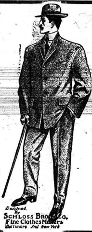
Designed by SCHLOSS BROS. CO. Fine Clothes Makers Baltimore and New York

Mens Suits from $5.00 to 25.00 Youth's Suits from $5.00 to 15.00 Boys Suits from $2.00 to 7.50.