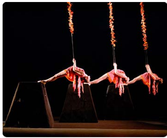
Winthrop Dance Theatre, fall 2008

Season ticket packages are available for the 2009-10 Department of Theatre and Dance production series.