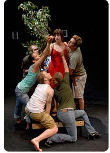
Spring One-Act Festival, 2009

Tickets: Wednesday-Thursday, $5 with Winthrop I.D./$10 general public; Friday-Sunday, $8 with Winthrop I.D./$15 general public Seating is limited; no late seating will be permitted.