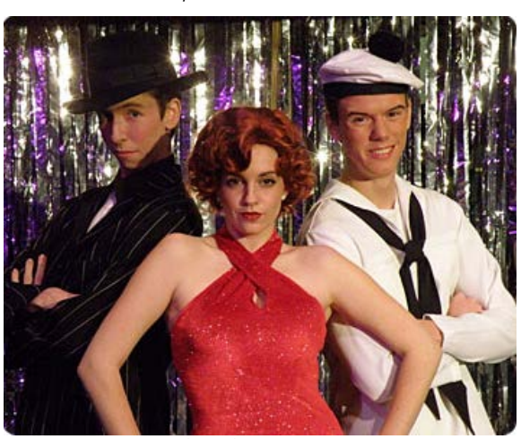
"Anything Goes," spring 2009

ROCK HILL, S.C. - Winthrop's Department of Theatre and Dance will kick off the 2009-10 season this September with "You Can't Take It with You," a screwball comedy picked to accompany the 2009 common book, Russell Baker's Great Depression-era autobiography "Growing Up." Season ticket packages are available for purchase online.