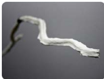
Work by Sandy Singletary