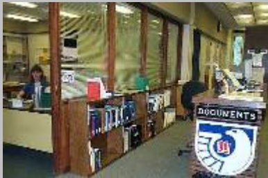
Federal Depository in Dacus Library