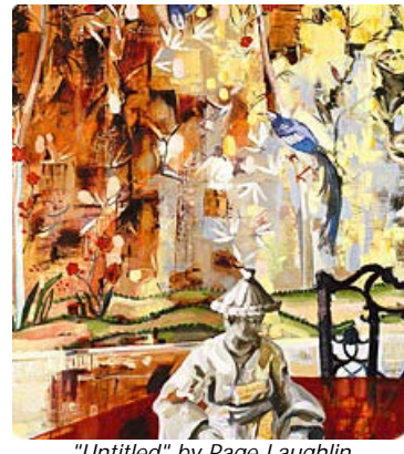
'Untitled" by Page Laughlin

ROCK HILL, S.C. - Two new exhibitions at Winthrop University Galleries explore patterns of light and dark and surreal images.