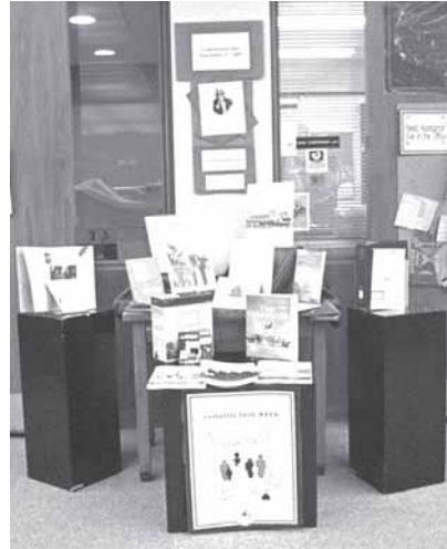
Constitution Day Exhibit 2007

The contest winner correctly answered all 10 questions and received a folder filled with government documents resources, handbooks, copies of the Constitution, a flash drive and chocolate!