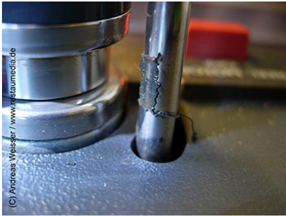
(figure a) Signs of binder degradation left on the playback machine. NOT an example from our collection.

should not be used more than five times. While there is some flexibility to that rule, it is generally a good rule of thumb to digitize an item once (and well) and allow that item's digital surrogate to be used by our patrons. In order to transfer these materials from an analog to a digital state and get it right the first time, I have spent the last two months locating analog equipment to play our a/v materials (see figure b), organizing and processing the oral history collection, and establishing digitization guidelines and a workflow for our audio.