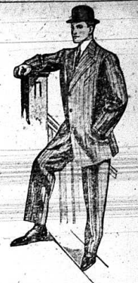
REPRESENTATIVE OF THE MAJORS OF MICHAELS-STEIN FINE CLOTHING

It Will Pay You to Come Miles and Miles To This Sale