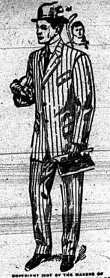
THE FIRST OF THE MAJORS OF MICHAELS-STEIN FINE CLOTHING