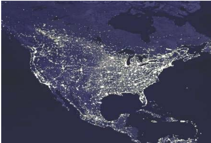
Night Lights 2001

Did you know that Dacus Library's Government Documents Department has maps? We have a variety of topographic, environmental, biogeographic, political, historical, forest and road maps from federal agencies such as the U.S. Geological Survey (USGS), Central Intelligence Agency (CIA), the Department of the Interior (DOI), and the National Oceanic and Atmospheric Administration (NOAA). Many maps produced by government agencies can also be found on the Internet.