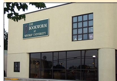
The Bookworm, pictured above, is nearing completion of the renovations to become the new home of the Louise Pettus Archives and Special Collections in December 2011.