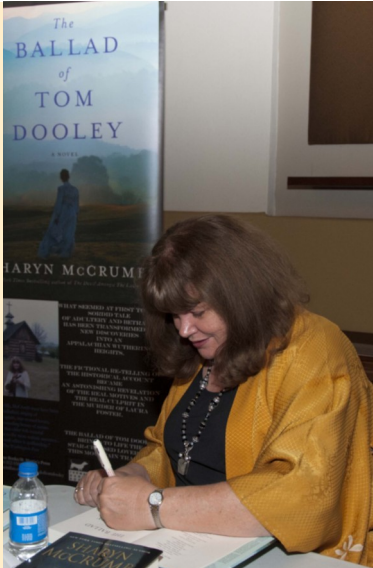
Sharyn McCrumb Autographing Copies of Her Book