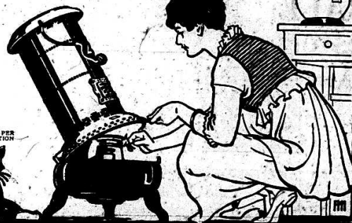
PER. MUR. PER PERFECTION

(New Jersey) BALTIMORE Washington, D. C. Nashville, Va. Richmond, Va. Charlotte, N. C. Charleston, S. C.