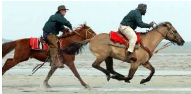
Sunrise and Marsh Tacky Races on Hilton Head Island, February 2009