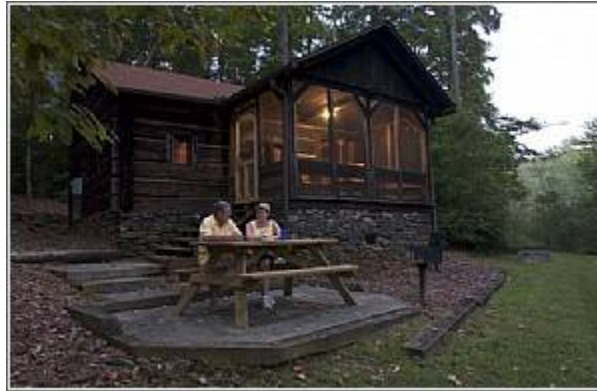
Cabin at Oconee State Park

Did you know that South Carolina State Parks is celebrating their 75 th birthday? Come Out and Play! Check out the Hot Deals and Packages, such as 40% off a rental cabin at Oconee State Park . From May 25 th – June 8th, a cabin for four costs as little as $340 a week! The cabins have AC but no TV or telephone. The Civilian Conservation Corps (CCC) built some of the cabins during the Great Depression. Check for rental specials at other state parks too.