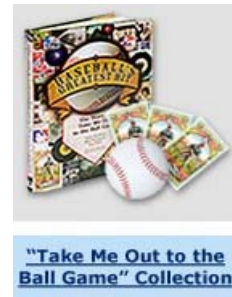
"Take Me Out to the Ball Game" Collection

Buy stamps, packaging, collectibles, artwork, books and toys at The Postal Store online.