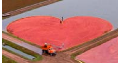
Cranberry bog flooded for harvest

The United States imported $2.1 million of cranberries from Canada during the first half of the year.