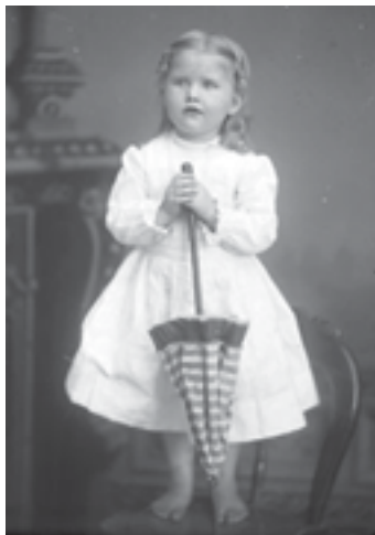
Child with Umbrella by Schorb

glass negatives, and prints. A small portion of the collection has been digitized and is available on the Pettus archives Web site. This collection is an excellent source of images relating to 19 th century York County.