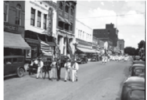
Main and Trade St., late 1930s by Ward

The archives has Ward's photograph collection of approximately 1300 pieces from the 1930s, 40s, 50s, and 60s.