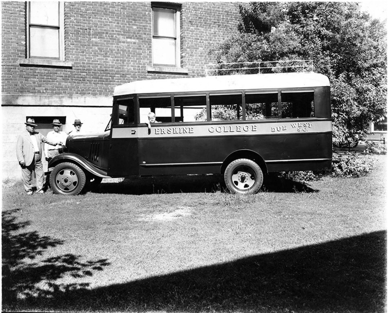
A bus made for Erskine College by the Rock Hill Body Company ca. 1940s