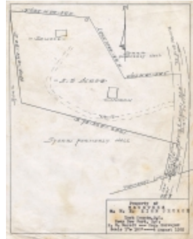
A.M.E. Zion Church - 1952