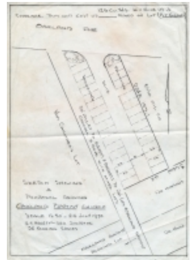
Oakland Baptist Church- 1970 Marret Surveys