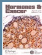
Hormones & Cancer

Translational Research on the Effect of Hormone Action on Cancer