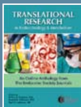
Translational Research in Endocrinology & Metabolism