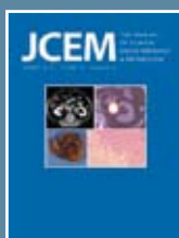
The Journal of Clinical Endocrinology & Metabolism

The Most Cited, Must-Read Clinical Journal in the Field