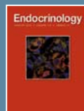
Endocrinology & Molecular Endocrinology

An In-depth, Enduring Resource With the Highest Impact Factor in Endocrinology and Metabolism