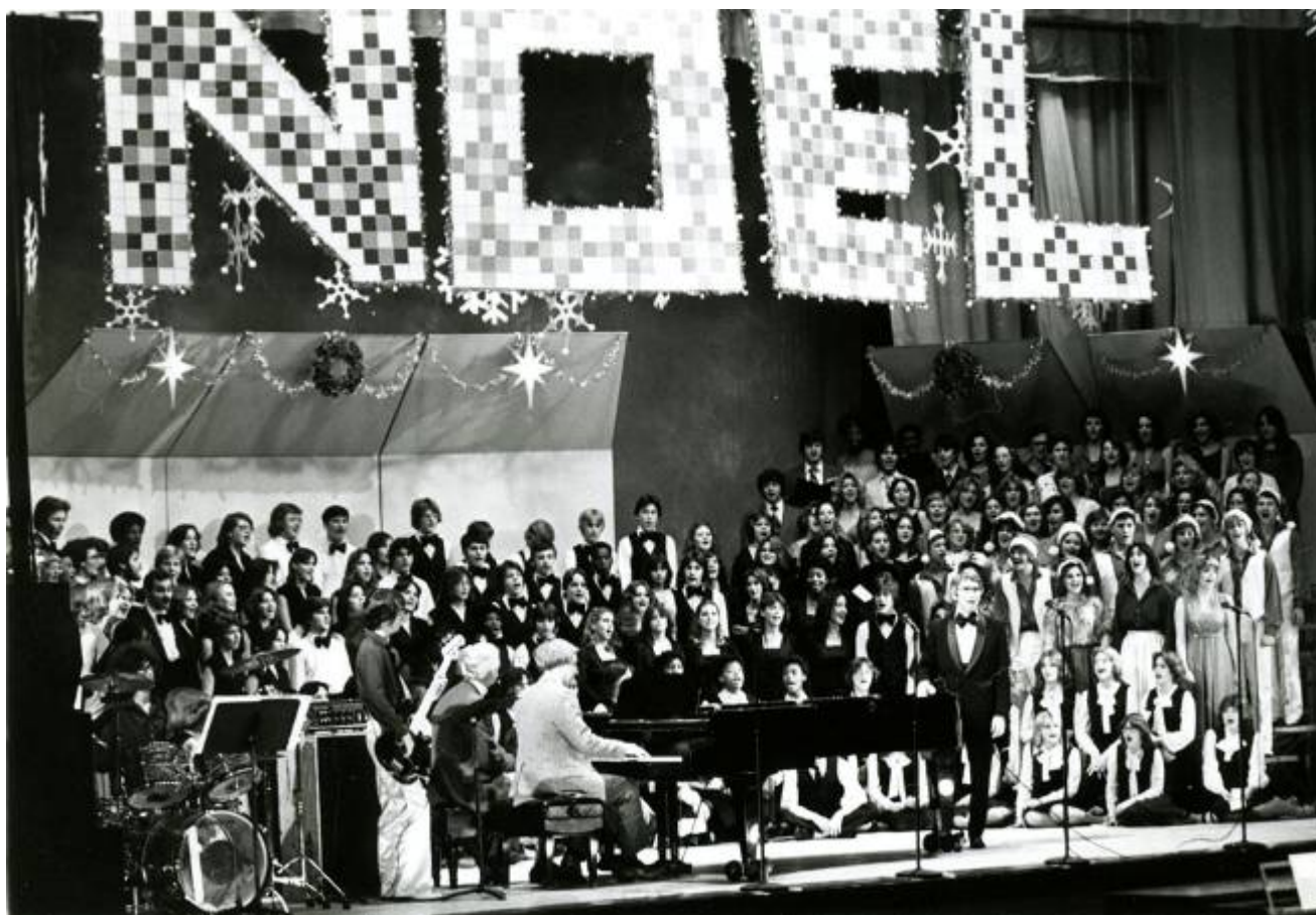
Winthrop Christmas Program in Byrnes Auditorium ca. late 1970s