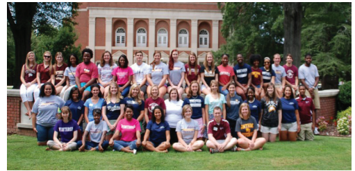
The Winthrop Ambassadors, the campus tour guides

experience. This role on campus is not only a lot of fun, but I have also met so many people through it that have made my freshman year memorable.