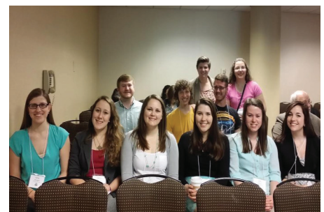
Honors Program students at the 2015 SRHC conference

niche in the bonds and ideas that conferences create for attendees.