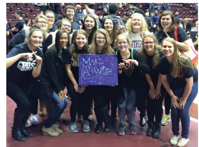
Sisters of Chi Omega supporting the Winthrop Eagles and the Make-A-Wish Foundation

lifted up more than I ever have been. I have found that being a Greek honors student has pushed me to strive towards higher goals of both academic and personal success that I don't think I would have thought possible beforehand. courses, and I was committing myself to begin a new member process into Pi Kappa Phi Fraternity. I knew I wanted to go Greek after meeting the guys in our chapter, but I was worried that it wouldn't be possible with my honors commitments. To my surprise, the exact opposite occurred; I found myself supported by Winthrop honors students, both my age and older, to join Greek life. Many other honors freshmen went Greek along with me, some even into my organization. Today, I have the privilege to call some of my fellow honors students my brothers, and the experience was all the better because both organizations have been the reason behind so much of my success at Winthrop University.