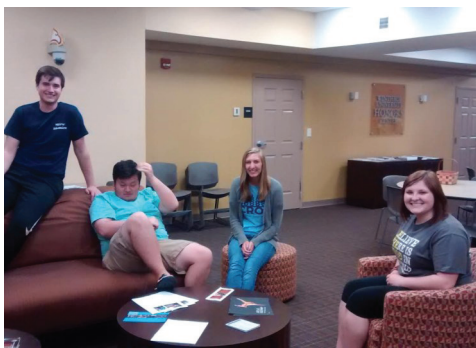
Honors students hanging out in the Honors Center

Fellows, researchers, and a host of other activities and organizations around campus and around the world. You will see inside honors classes and hear about study abroad and research conference opportunities. These are just a few of the opportunities the Winthrop Honors Program provides. It offers so much that the only way to fully see all the benefits is to come see for yourself. I hope you enjoy this glimpse into the Honors Program and Winthrop life.