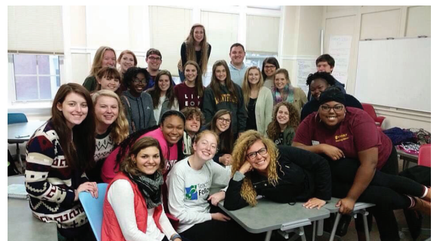
A Teaching Fellows classroom

One of my greatest joys since coming to Winthrop has been becoming a part of the many organizations it has to offer. My involvement began before I even came to Orientation with the Teaching Fellows organization. We quickly became a close knit group, and I have created bonds that will last a lifetime. Another organization I am a part of is Winthrop University's Honors Association, or WUHA! Being in WUHA! has allowed me to become a part of a group of elite students who care a great deal about not only their grades but also making a difference in the world. I am honored to be surrounded by such wonderful and passionate people and am looking forward to seeing where the world will take us.