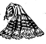
50c to $3.00

CHILDREN'S UNDERWEAR AT 15c, 20c, AND 25c EACH GARMENT.