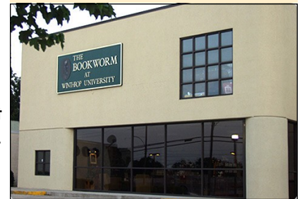
The Bookworm, pictured above, is nearing completion of the renovations to become the new home of the Louise Pettus Archives and Special Collections in December 2011.