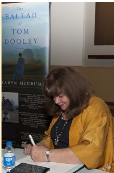
Sharyn McCrumb Autographing Copies of Her Book