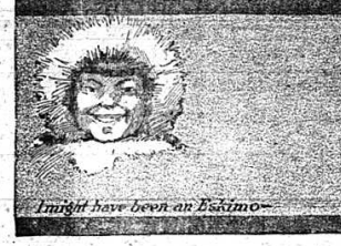
"I might have been an Eskimo—" "Of an Indian—" "Glad just now Southern Gentleman"